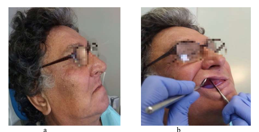
Fig. 1: (a) The Position of the Wings of the Nose at Rest; (b) Change in the Position of the Nose Wing When Applying Canine Line in the Wax Pattern.

In most cases, a guideline for choosing the size of artificial front teeth is the distance between the canine lines applied on the occlusal wax pattern, for a dental technician. To determine the canine line and apply it to the wax pattern, the doctor needs to raise the lip, while the wing of the nose changes its position. As a result of which the definition of the canine line relative to the wing of the nose does not correspond to the actual position of the canines [8] (see Fig. 1).