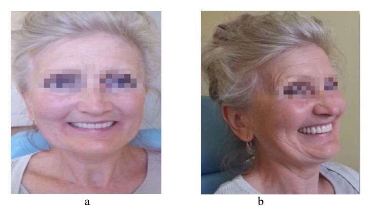
Fig. 3: Appearance of the Patient After Prosthetics According to the Proposed Method: (a) Lack of Cheek Corridors; (b) Corners of the Mouth are Raised, Nasolabial Folds Correspond to Age.

Practical Recommendations: Based on the study, we have developed tables for the express determination of the mesiodistal dimensions of the front teeth of the upper and lower jaw (Table 3; Table 4).