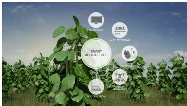
Figure 2: Proposed Structure

The mentioned framework causes Farmer to enhance superiority and amount of their land capitulated by detecting surrounding heat and soil dampness esteem, moistness esteems & water altitude of the storage tank from the ground level with no individual intercession. Via utilizing the idea of IOT framework can be further effective. The framework includes remote sensor put in the field to obtain the continuous qualities, an ace hub to get and transmit procured data to control segment, & a control segment which controls the trickles for watering subsystem. Every hub incorporates temperature, stickiness, soil dampness and water altitude sensors and also microcontroller and transfer exchanging unit. The detected information from every hub is transmitted to the ace hub by means of IOT. Once the information is prepared and choice is resolved at the control area with the assistance of water system calculation, the controlling activity is sent to remote sensor hub. The microcontroller from the hub controls transfer exchanging unit and watering subsystem in like manner. Report framework that is an android application is created to convey ongoing field data to Farmer. Additionally it requests that Farmer react to a basic occurrence, for example, ascend in temperature and water necessity for plants. And compound with current pulses is also used for more farm security.