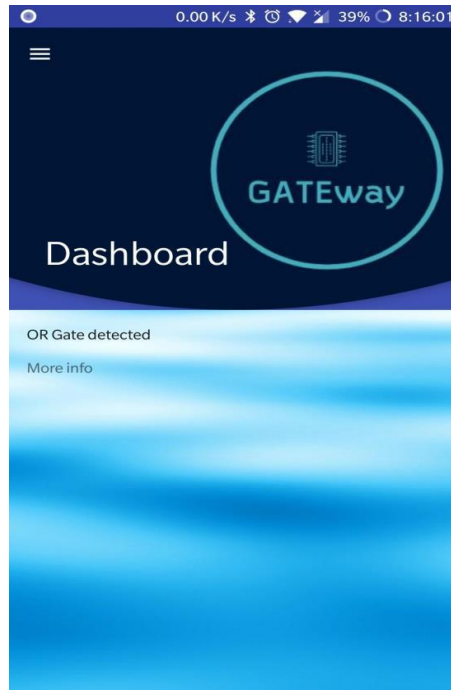
Figure 3: GATEway Companion App.

The GATEway Companion mobile application is available for android devices, having Android version above 6.0 (Marshmallow).