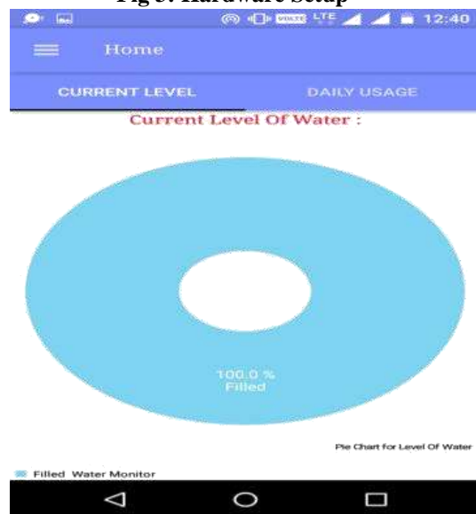
Fig 4: Current Level of Water