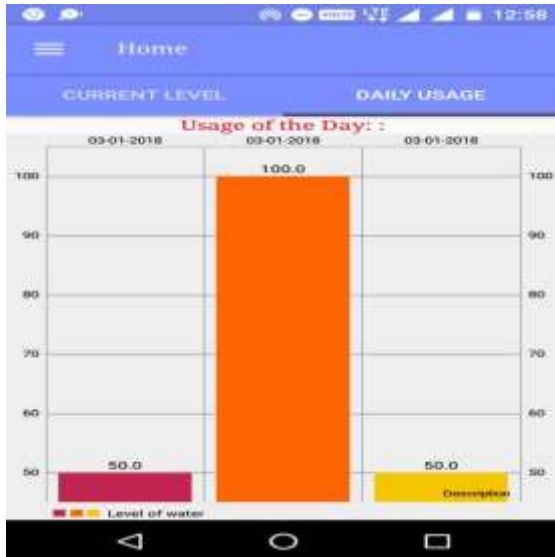
Fig 5: Daily Usage (Represented in Bar Chart)