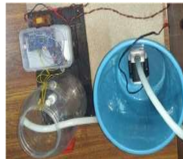
Fig 3: Hardware Setup