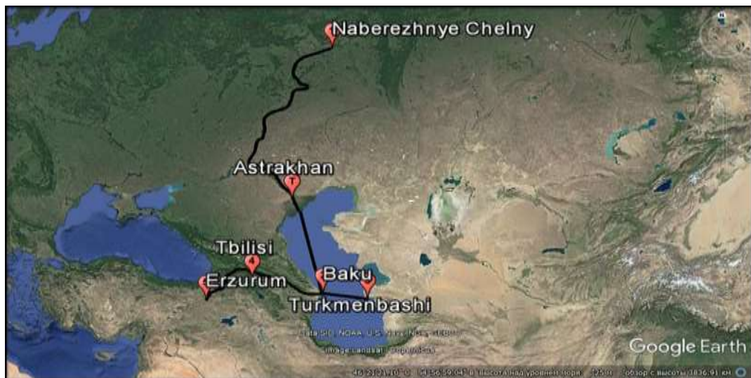
Figure 3. Location of Steiner points in relation to water logistics

Using our adaptation, proceeding from the fact, that the cost of water logistics is the cheapest in comparison with other ways of delivery, the choice of Steiner point is determined on the basis of the already existing large ports (Figure 3).