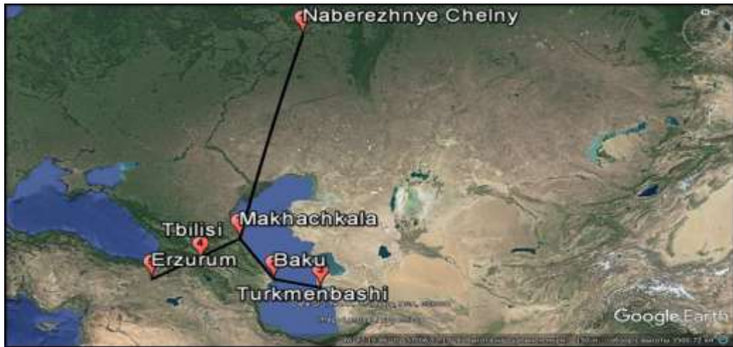
Figure 2 Location of Steiner points in the solution of classical problem

The application of classical algorithm is an effective way to find the best location, in relation to cities, but without considering the availability of access roads to these initial points. Taking into account the possibility of using existing networks of roads and sea routes, the use of geographically advantageous location of Makhachkala, towards the neighboring countries (the sale markets for the products), the choice of this city for the location of warehouse is economically attractive. If it is necessary to use available active logistics networks, the proposal of additional correction, using an adapted algorithm for solving the Steiner problem, will allow to determine the rational location of the warehouse at the current time.