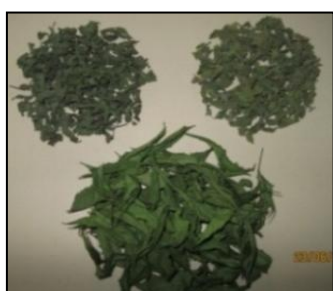
Figure: 1. Dried leaves of Mentha arvensis (upper left) Ocimum sanctum (upper right), and Azadirachta indica (below).

Plant Material: Fresh leaves of O. sanctum , A. indica , and M. arvensis were collected from normal fields of Lucknow district, Uttar Pradesh, India; identified and authenticated at BioAxis DNA research centre and by various literatures. Sample leaves were washed thoroughly under running tap water and air dried for 5 days.