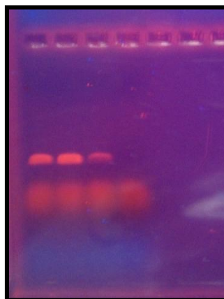
Fig 1: showing DNA bands on gel electrophoresis 1 st band = DNA from cigarette butt 2 nd band = DNA from chewing gum 3 rd band = DNA from lipstick mark

Fig1: Qualitative analysis of DNA by gel electrophoresis:-