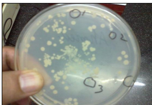
Fig 1: Master plate with Isolated Colonies: