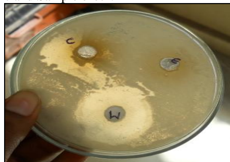
Fig 3: The zones of inhibition formed by Standard antibiotic and Sample broth:

W= standard Ampicillin, C = Test Broth, E= Sterile water