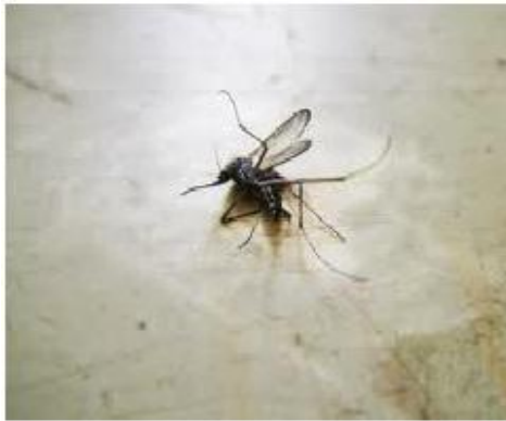
Fig 2: Starving

Second groups Mosquitoes were also collected and the GI content was oozed and subjected for micro titration. These groups contained the bacteria in their GI obtained from the media where they were grown. This was followed by blank titration using the same procedure, wherein instead of Mosquitoes content plain 0.01 N HCl solutions was titrated to check the effectiveness of the reagent.