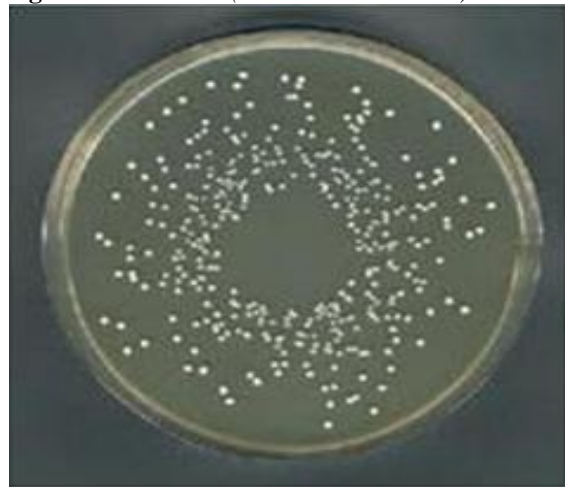
Fig 6: CFU count of ( Lactobacillus casein ) bacteria