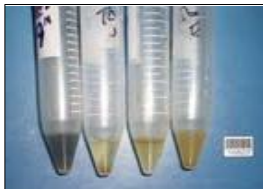
Fig 3: Test for terpenoids, one of the tubes showing the color change to green bluish color indicating the presence of steroids.

4mg of extract was treated with 0.5 ml of acetic anhydride and 0.5ml of chloroform. Then concentrated solution of sulphuric acid was added slowly. A red violet color is shown for terpenoids and green bluish color for steroids.