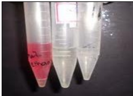
Fig 5: Test for tannins, no color change to black or blue indicates the absence of tannins.

To 0.5ml of extract 1ml of water and 1-2 drops of ferric chloride solution were added. Blue color was observed for galli tannins and green black for catholic tannins [Iyengar 1995]