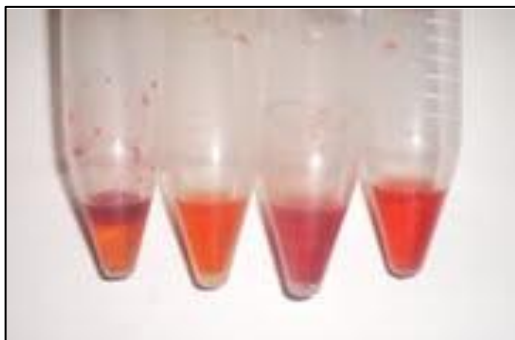
Fig 1: Alkaloid test showing the formation of white yellowish precipitate at the bottom of the tubes.

Alkaloids are basic nitrogenous compounds with definite physiological and pharmacological activity. Alkaloid solution produces white yellowish precipitate when a few drops of Mayer's reagent is added. Most of the alkaloids are precipitated from neutral or slightly acidic solution by Mayer reagent.