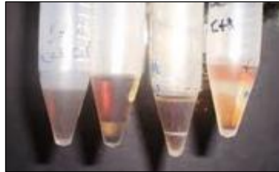
Fig 2: Test for glycosides, some tubes showing the formation of reddish brown color at the junction of the two layers.

To the solution of the extract in glacial acetic acid 0.5 ml of acetic anhydride and 0.5 ml of chloroform were added. Then concentrated solution was added slowly, formation of reddish brown color at the junction of two layers and the bluish green color in the upper layer would be seen.