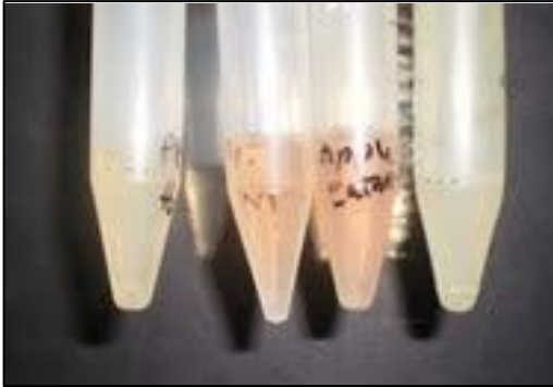
Fig 4: Test for flavonoids showing the change in the color to orange, indicating the presence of flavones.

4mg of extract was treated with 1.5ml of 50% methanol solution. The solution was warmed and metal magnesium was added. To this solution 5-6 drops of concentrated HCL was added and red color was observed for flavonoids and orange for flavones.